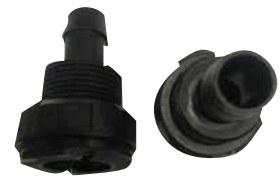
(A13) 3/4 BULKHEAD FITTING

VISIT THE INNOVATIVE GROWERS EQUIPMENT YouTube PAGE FOR STEP BY STEP VIDEO INSTRUCTIONS.