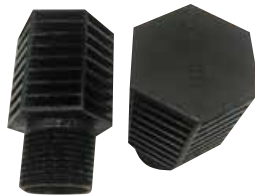
(A12) SCREEN FOR BULKHEAD FITTING