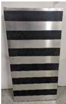
4' Catwalk Platform

*2' Catwalk Platform is an optional platform