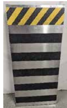
4' Catwalk Platform End