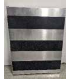
2' Catwalk Platform*

*2' Catwalk Platform is an optional platform