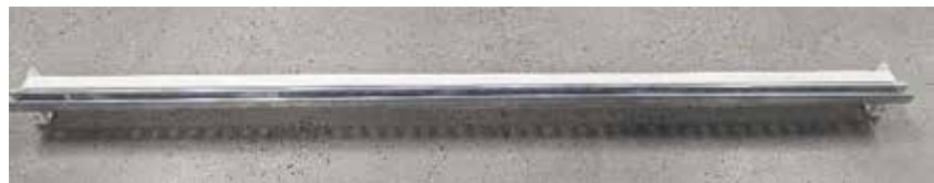
Catwalk Side Beam*

*Catwalk Side Beams come in 8', 10', or 12' lengths