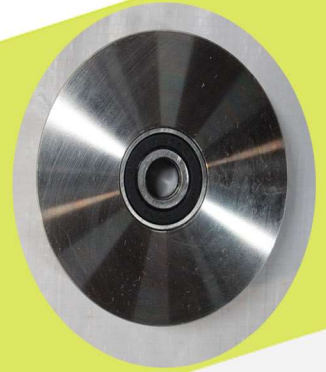
Full stainless-steel wheel 4 1/2" diameter