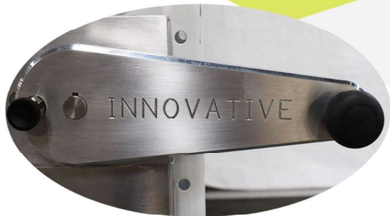
Heavy duty aluminum handle - with stainless steel locking plunger and rotating knob