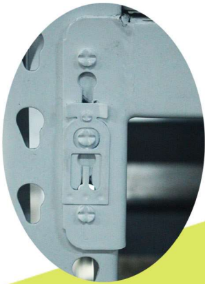
Heavy duty welded - white racks