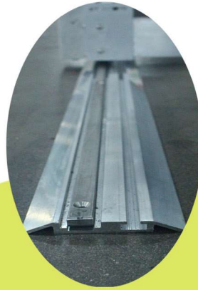
Aluminum track with stainless steel insert for corrosion resistance