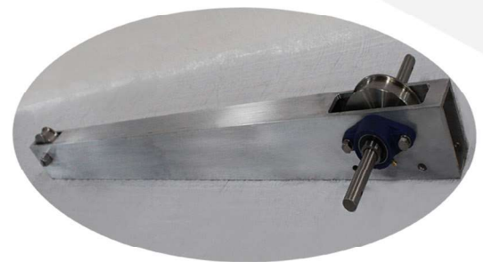
Solid aluminum tube housing for stainless steel wheels and mounting of control arm