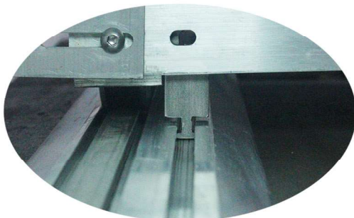
Stainless steel anti-tip at every track